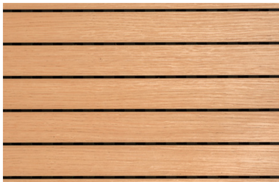
Absorption data for Groove 24 (EN 354: 2003)