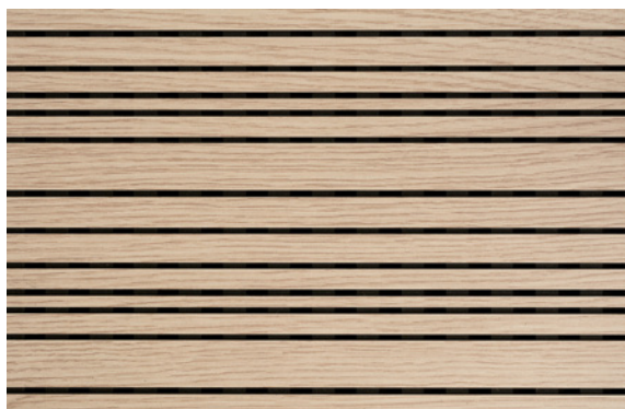
Absorption data for Groove R (EN 354: 2003)