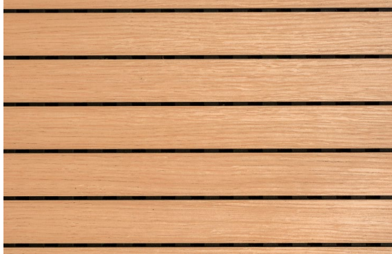
Absorption data for Groove 24 (EN 354: 2003)