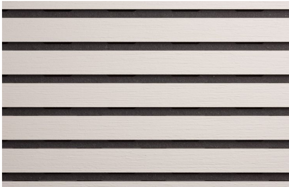
Absorption data for Groove 24-W (EN 354: 2003)