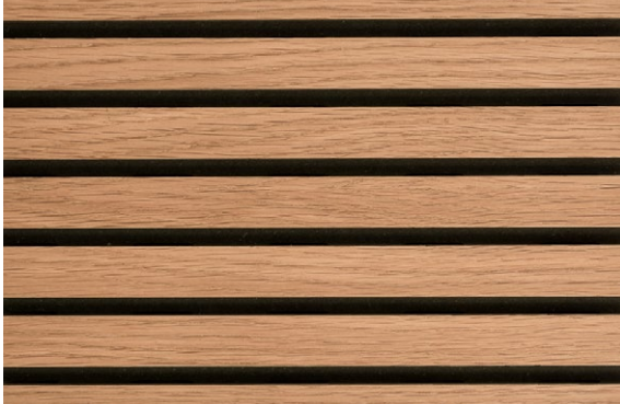
Absorption data for Groove 24-W (EN 354: 2003)