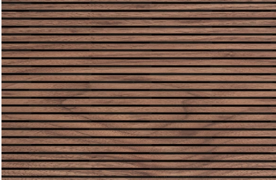
Absorption data for Groove 5 -H (EN 354: 2003)

3mm slot width, 5mm slat width (higher perforation than Groove 5)